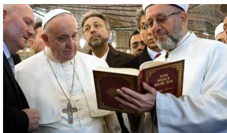
Roman Pope and Muslims