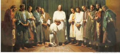
Disciples understood parables

We really need Holy Spirit to understand what era we are in like Paul did.